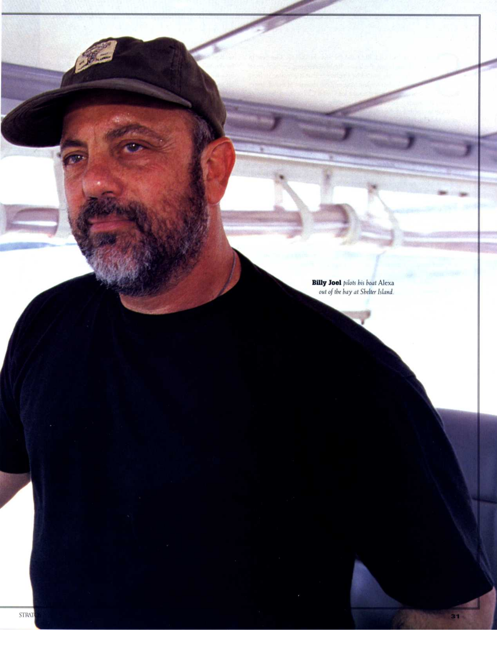
Billy Joel pilots his boat Alexa out of the bay at Shelter Island.